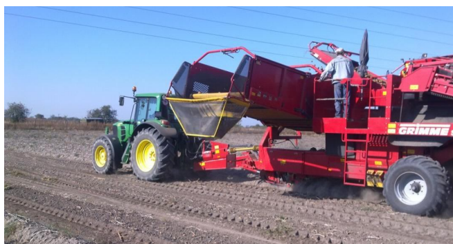
Figure 1 Two-line potato harvester Grimme SE 170-60

At present, when the potatoes are grown in Slovakia on an area 10 600 ha is necessary to maintain the highest possible yield and quality of production, in order to the farms to be resisted competitive pressure. This requires in addition of high-quality technology, planting materials, fertilizers and organic fertilizers selection of appropriate cultivation of plots, or their quality preparation.