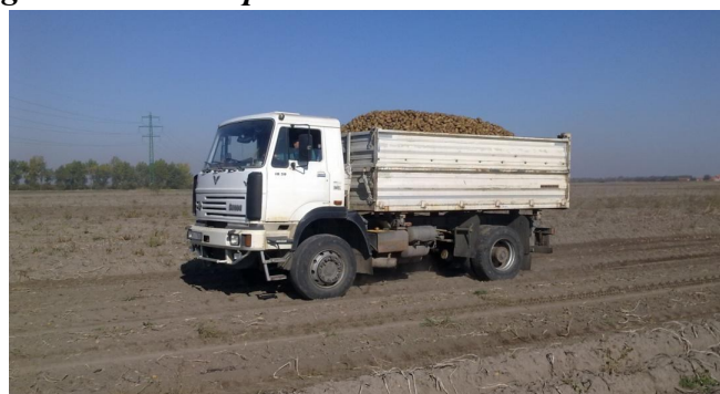
Figure 2 Trailer HW 80

In 2011, was the average potato yields 22.6 \text{ t ha}^{-1} . Top farmers achieved yields 35 to 45 \text{ t ha}^{-1}