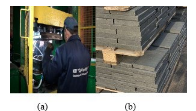
Fig. 4. Production process (a) and appearance (b) of paving slabs produced by CE "Dobrobut" of Illintsi community

Rys. 3. Morfologia odpadów stałych i kierunków ich użycia w "Dobrobut" w gminie Illintsi, 2021 [tysiąc ton]