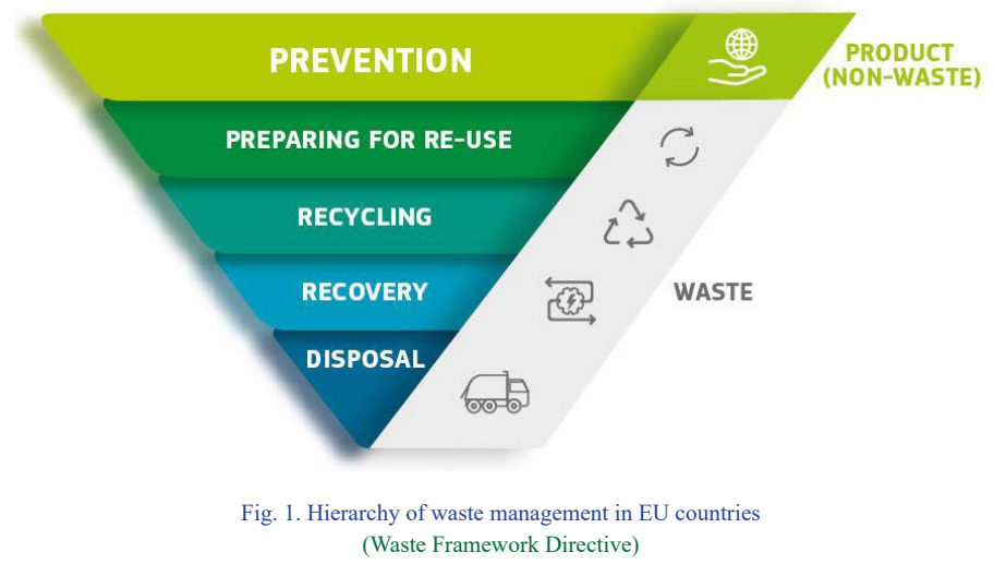
Rys. 1. Hierarchia zarządzania odpadami w krajach UE

Unfortunately, in Ukraine, waste management based on this principle is rather an exception than a rule for communities. However, there are communities that pay a lot of attention to effective waste management, and their activities can become a successful example for others. One of these is the Illintsi urban territorial community of the Vinnytsia region, which has started a number of projects on waste management since 2016 and is successfully implementing them now (Fig. 2).