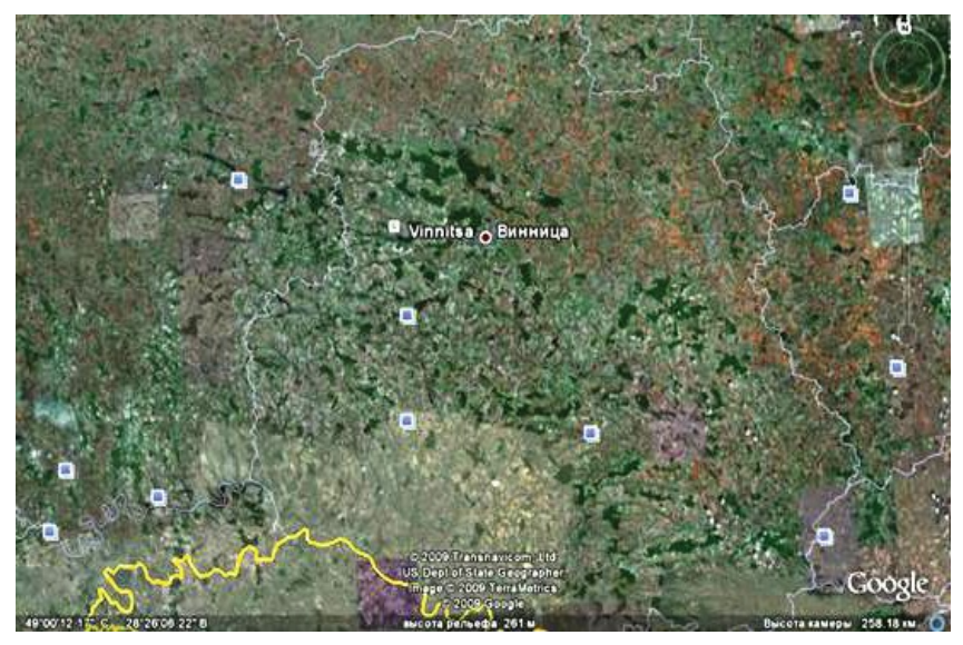
Figure 3. Vinnytsia region on a satellite image

In general, Vinnytsia region is characterized by the following soil cover