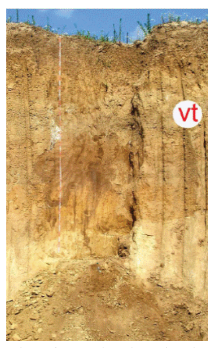
Figure 2. The Vitachiv horizon in a section of Pleistocene sediments (Yakushintsi village, Vinnytsia district, Vinnytsia region)