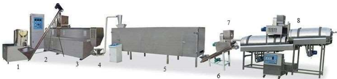
Figure 3. Technological line for the production of corn snacks: 1 - mixer; 2 - screw conveyor; 3 - extruder; 4 - air conveyor; 5 - dryer; 6 - conveyor; 7 - sprayer; 8 - cooler.

Spices are stored in paper bags at a temperature not exceeding 15 ° C and relative humidity of not more than 75% in dry warehouses, not contaminated with collar pests [3].